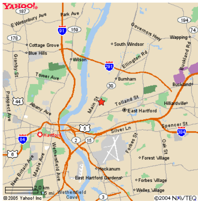
East Hartford Area