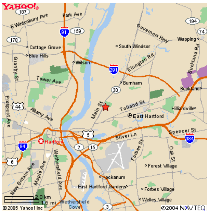
East Hartford Area